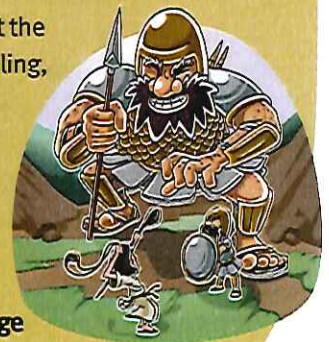
Bible story based on 1 Samuel 17

This was a day no-one would forget, when the courage of a shepherd boy saved a nation.