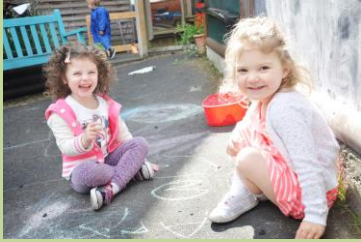
Mark Making with friends!